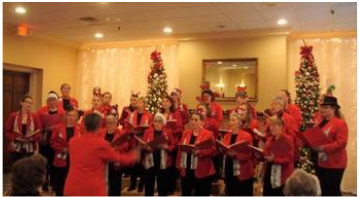
Clustered Spires Chorus entertains