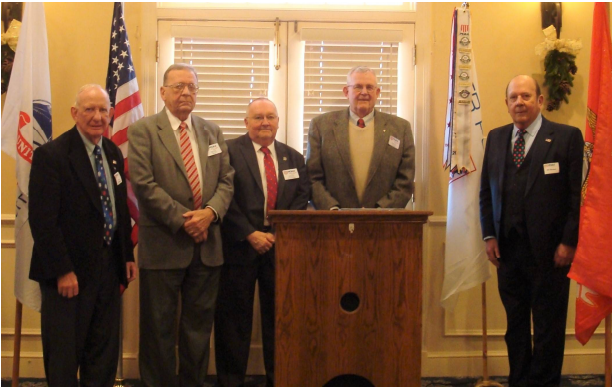
Chapter President and Board members presenting the MOAA Excellence Award to the membership