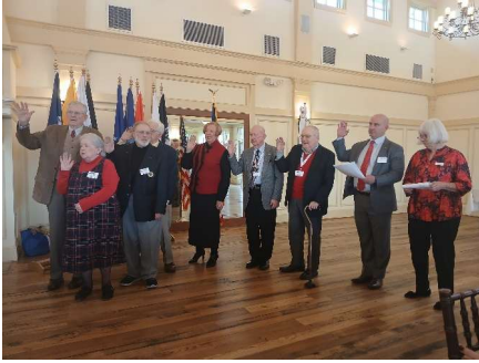
Newly elected Officers and Board members for 2025-2026 take the oath of office.