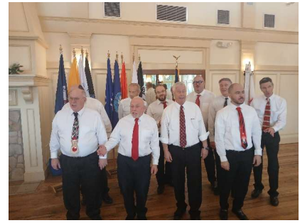
The Frederick Catoctones Chorus provided entertainment.