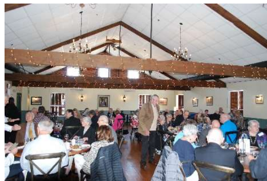
Members enjoy the Carriage House buffet